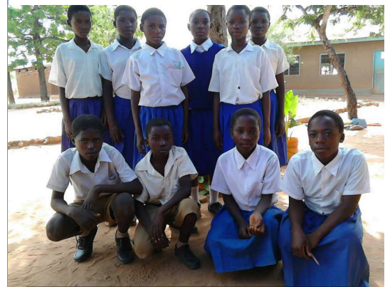
The Kingiti Fund's 2015 Kingiti Primary School Graduates

abilities may take them. We look forward to many more years of serving the children in greatest need in Kingiti village.